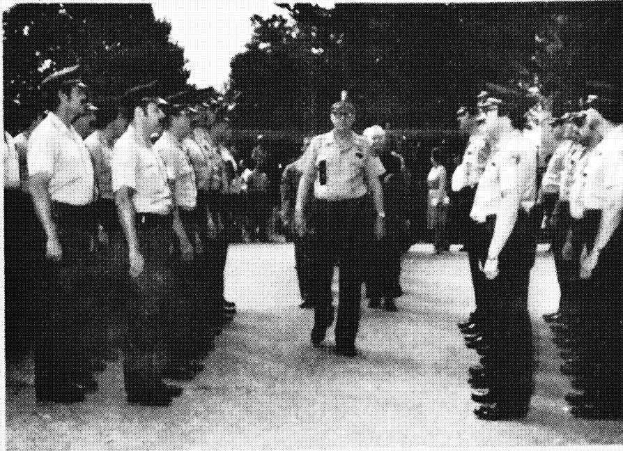
ANNUAL INSPECTION AT JACKSON SQUARE