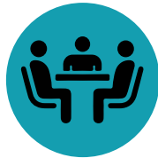
Community-Police Mediation Program