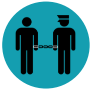
Use of Force