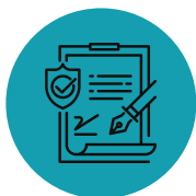
Audits and Policy