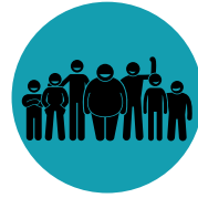
Community Outreach & Learn Your Rights in the Community (LYRIC)